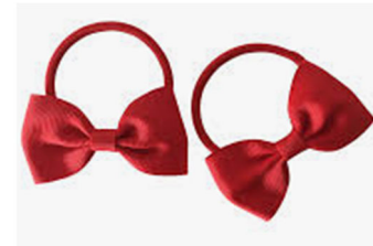
Practical hair elastics with small bows in school colours

Plain hair elastics/boggles can be any colour as they are Functional and small