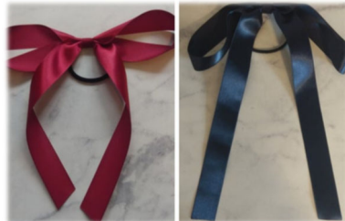
Hair elastic with small ribbons in school colours